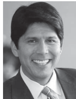
Kevin de León (D), SD 22 — Part of Los Angeles. (916) 651-4022. (2018)