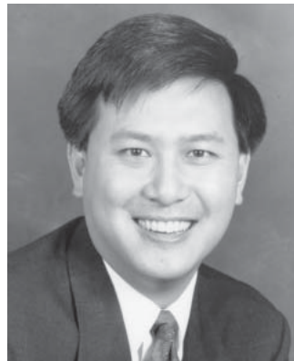
Controller John Chiang (D) 300 Capitol Mall, Suite 1850 Sacramento, CA 95814 (916) 445-3028