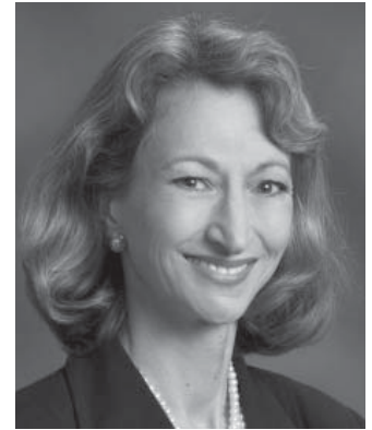
Secretary of State Debra Bowen (D) 1500 11th Street, 6th Floor Sacramento, CA 95814 (916) 653-6814