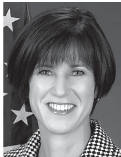
Mimi Walters (R), SD 33 — Part of Orange. (916) 651-4033. (2016)