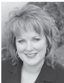
Shannon Grove (R), AD 32 — Part of Kern and San Bernardino. (916) 319-2032. (2016)