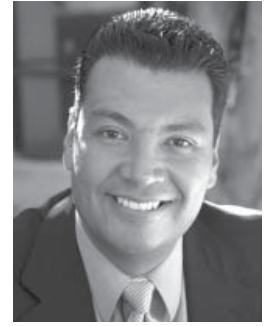
Alex Padilla (D), SD 20 — Part of Los Angeles. (916) 651-4020. (2014)