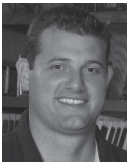
David Valadao (R) AD 30 — Kings, part of Fresno, Kern and Tulare. (916) 319-2030. (2016)