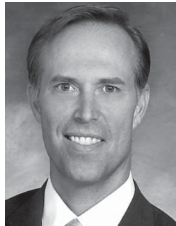
Jared Huffman (D) , AD 6 — Marin, part of Sonoma. (916) 319-2006. (2012)