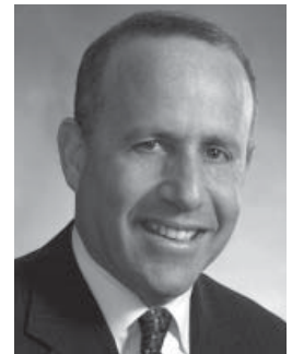
Darrell Steinberg (D), SD 6 — Part of Sacramento. (916) 651-4006. (2014)