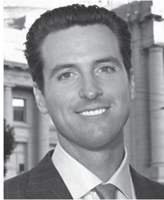
Lieutenant Governor Gavin Newsom (D) State Capitol, Room 1114 Sacramento, CA 95814 (916) 445-8994