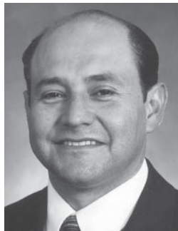
Lou Correa (D), SD 34 — Part of Orange. (916) 651-4034. (2014)