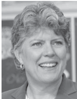
Julia Brownley (D), AD 41 — Part of Los Angeles and Ventura. (916) 319-2041. (2012)